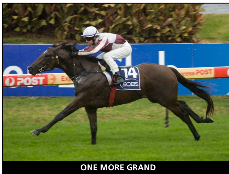
ONE MORE GRAND