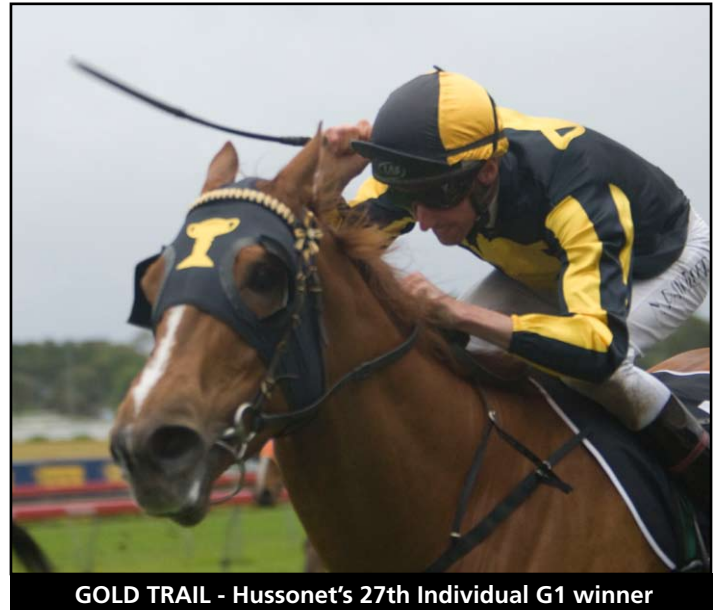
GOLD TRAIL - Hussonet's 27th Individual G1 winner