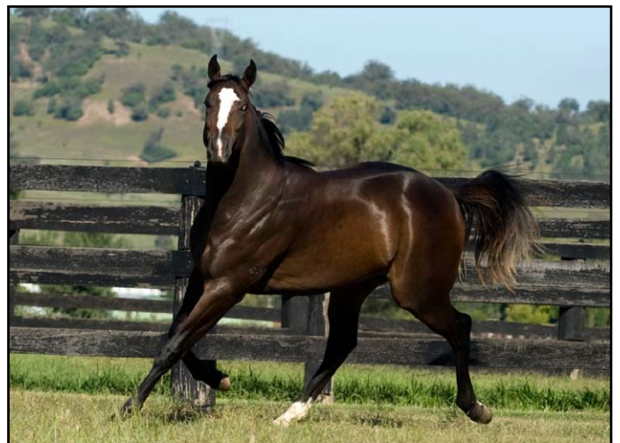
Beneteau - Redoute's Choice ex Slice Of Paradise

The 2YO colt will be aimed at either the 2010 Blue Diamond Series or may prusue a Golden Slipper campaign.