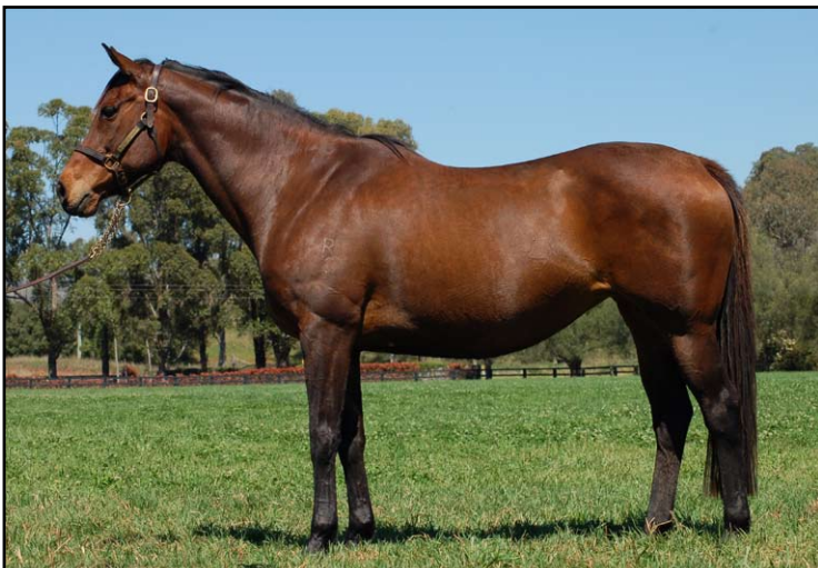
Zest - Granddam of MM 2YO winner, Military Rose

As broodmare sire Flying Spur is responsible for three G1 winners, three individual earners of more than $1m in prizemoney, and in terms of juvenile speed, the winners of the 2009 Golden Slipper and the 2010 Magic Millions.