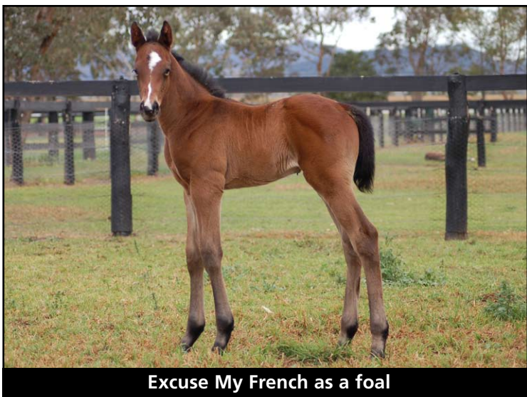
Excuse My French as a foal

Lot 305 – A granddaughter of the G1 winner SILVER CHALICE