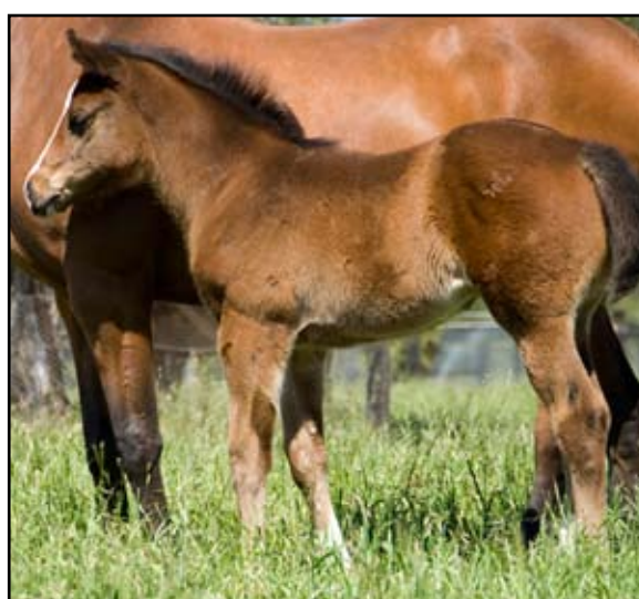
(Bellerive Stud) Bay filly by Redoute's Choice ex Zaldivar. Foaled 25 August. Photo 7 Oct. The daughter of a half-sister to DEREBEY - STARLIGHT (H.K.), DARALINSHA (dam of DARALIMARA , DARAYDALA ), GENTLE GENIUS , DARATA (dam of DARYABA ), DARBAWAN , Darabaka (dam of FAR CRY ).

◆ CHARGE FORWARD ◆ DANZERO ◆ FLYING SPUR ◆ HUSSONET ◆ NOT A SINGLE DOUBT ◆ REDOUTE'S CHOICE ◆ SNITZEL ◆ STARCRAFT