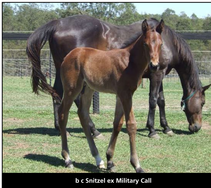
b c Snitzel ex Military Call