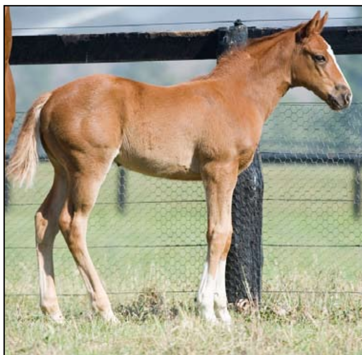
Chestnut filly by Snitzel x Hula Flight, foaled 17-Sept. Photo 20 Oct. Daughter of a G1 winner.