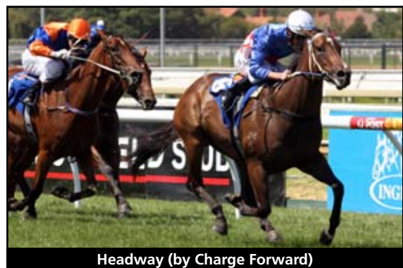
Headway (by Charge Forward)