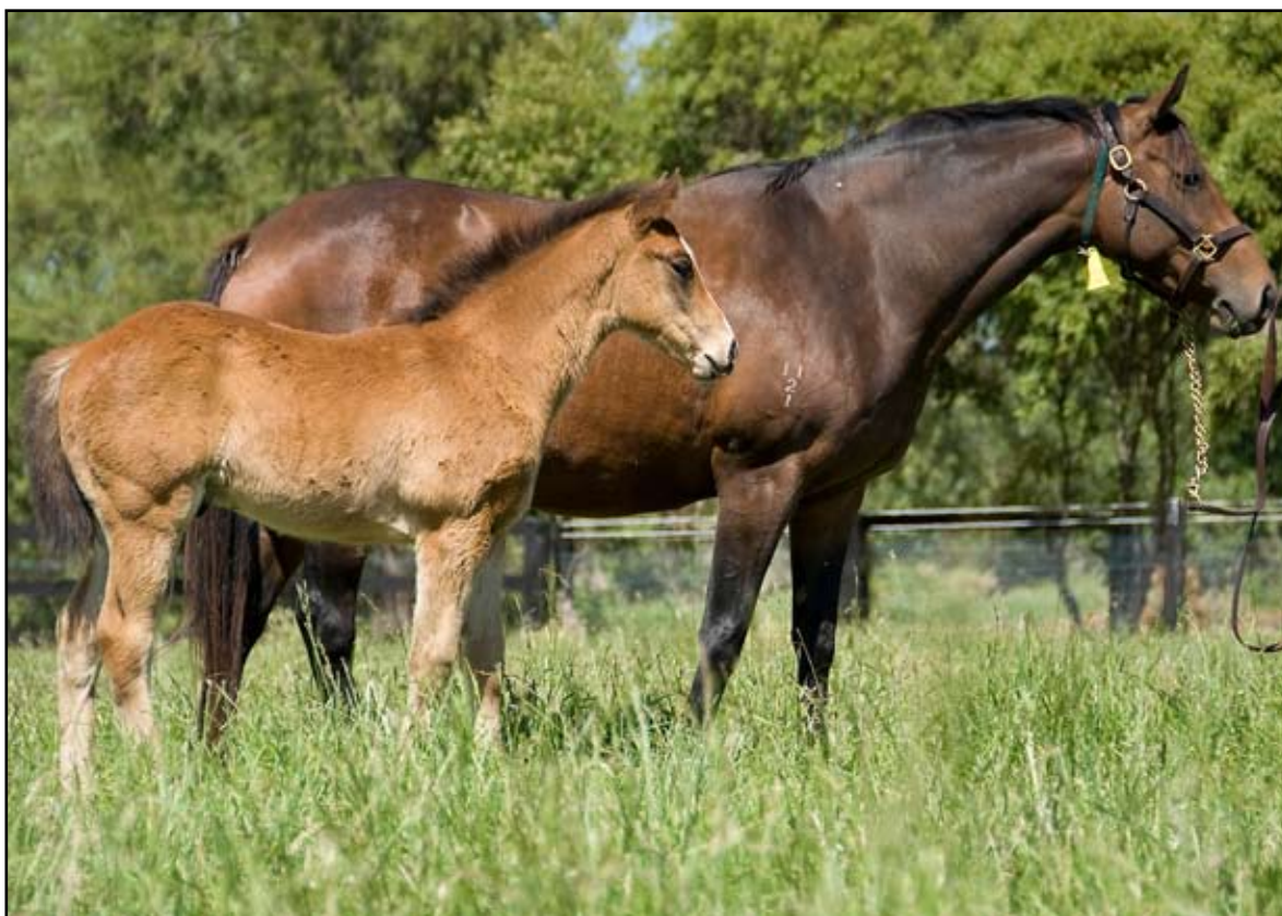
(Bellerive Stud) Bay colt by Starcraft x Spirited Dancer, foaled 10 Aug. Photo 7 Oct. Out of a daughter of Sadler's Wells who is a three-quarter sister-in-blood to POLICY MAKER , SAGAL WELLS , Peinture Rare . Half-sister to PEINTURE BLEUE (dam of triple G1 winner and sire PEINTRE CELEBRE , POINTILLISTE and PEINTURE ROSE ), PROVINS , PARME , Chateau Royal , and Palmeraie (dam of PUSHKIN and PLACE ROUGE )

◆ CHARGE FORWARD ◆ DANZERO ◆ FLYING SPUR ◆ HUSSONET ◆ NOT A SINGLE DOUBT ◆ REDOUTE'S CHOICE ◆ SNITZEL ◆ STARCRAFT