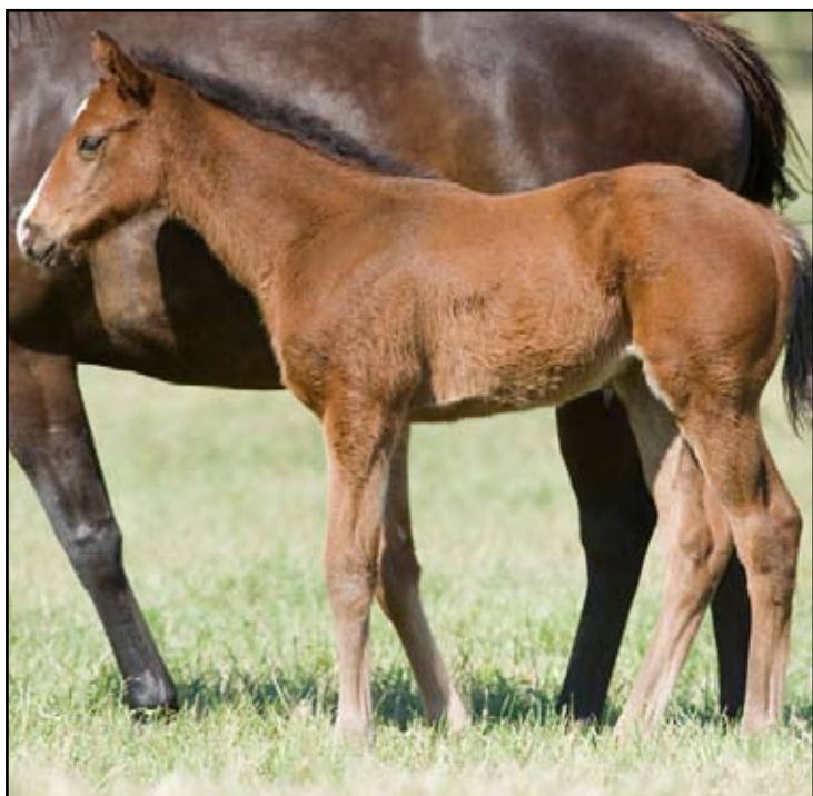
Bay filly by Redoute's Choice x Covertly, foaled 16-Sept. Photo 20 Oct. Out of the G1 WATC Railway S. winner COVERTLY .