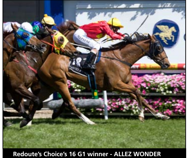
Redoute's Choice's 16 G1 winner - ALLEZ WONDER