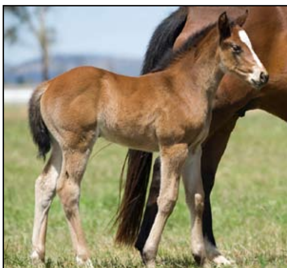
Bay filly by Charge Forward x Wester Skeld. Foaled 1-Oct. Photo 16 Oct. A half sister to 4 winners (from 4 to race). A grand-daughter of the G1 Keeneland Queen Elizabeth II Challenge Cup S. winner DANISH .