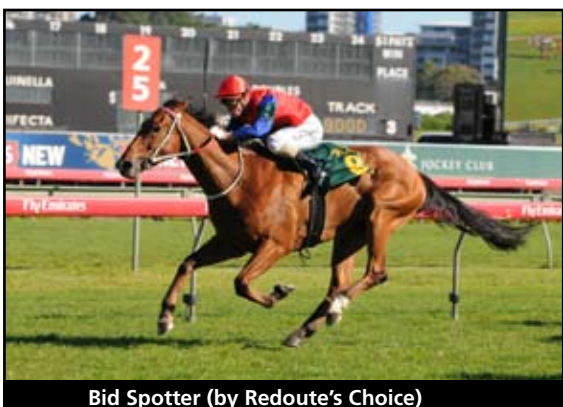
Bid Spotter (by Redoute's Choice)