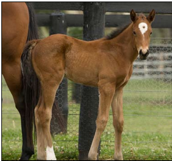
Bay filly by Danzero x Bella Costa. Foaled 2-Oct. Photo 16 Oct. The daughter of a winning half-sister to NIAGARA FALLS .