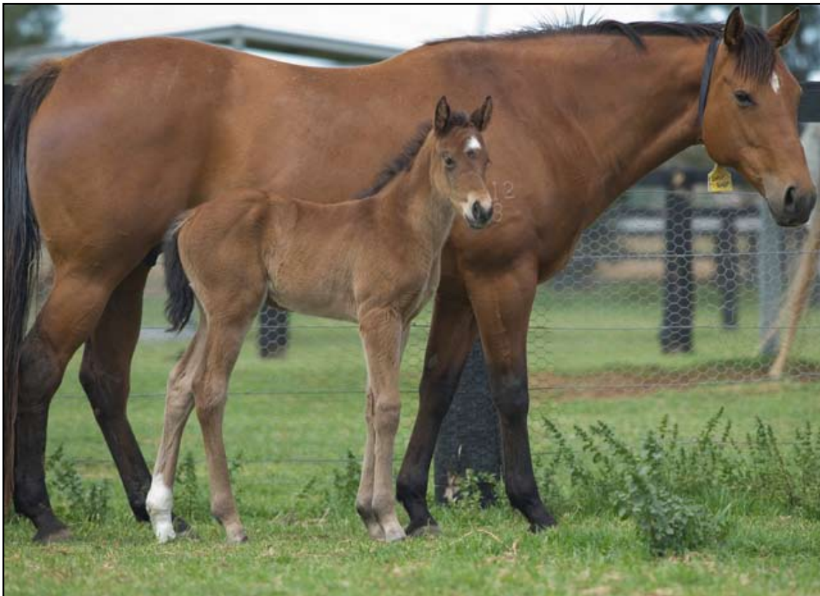
(Arrowfield) Bay filly by Redoute's Choice ex Snip Snip, foaled 11 Oct. Photo 16 Oct. This filly is a half sister to two winners (from two to race) including the G3 VRC Maribyrnong Plate winner HUSSON LIGHTNING . Snip Snip is a winning half-sister to FLYING SPARKS , Only Version , Geiger Sparkle , and Travelling Girl (dam of Thundering Girl )