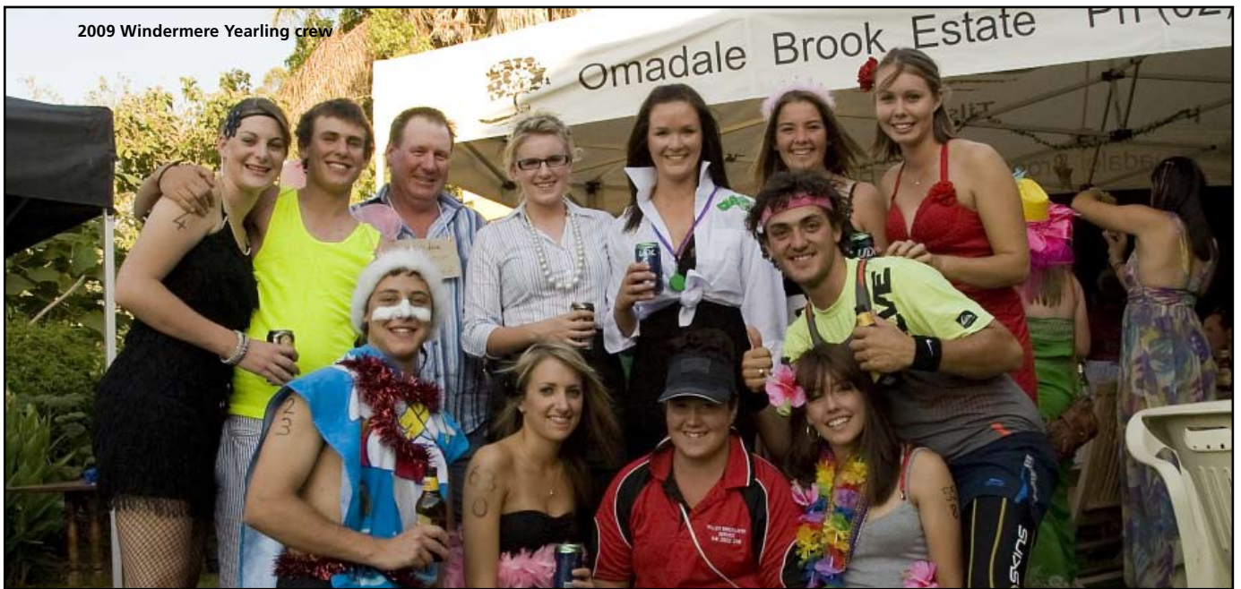
2009 Windermere Yearling crew