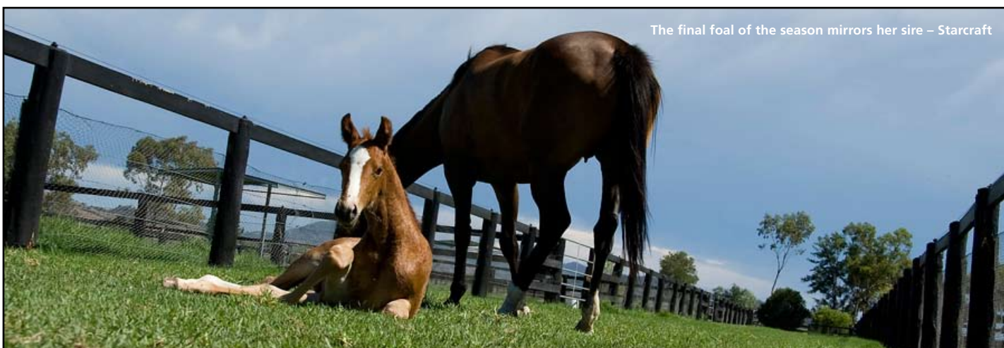
The final foal of the season mirrors her sire – Starcraft

◆ CHARGE FORWARD ◆ DANZERO ◆ FLYING SPUR ◆ HUSSONET ◆ NOT A SINGLE DOUBT ◆ REDOUTE'S CHOICE ◆ SNITZEL ◆ STARCRAFT