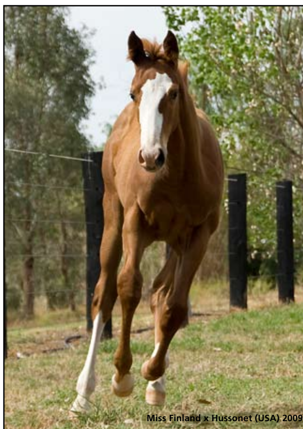
Miss Finland x Hussonet (USA) 2009