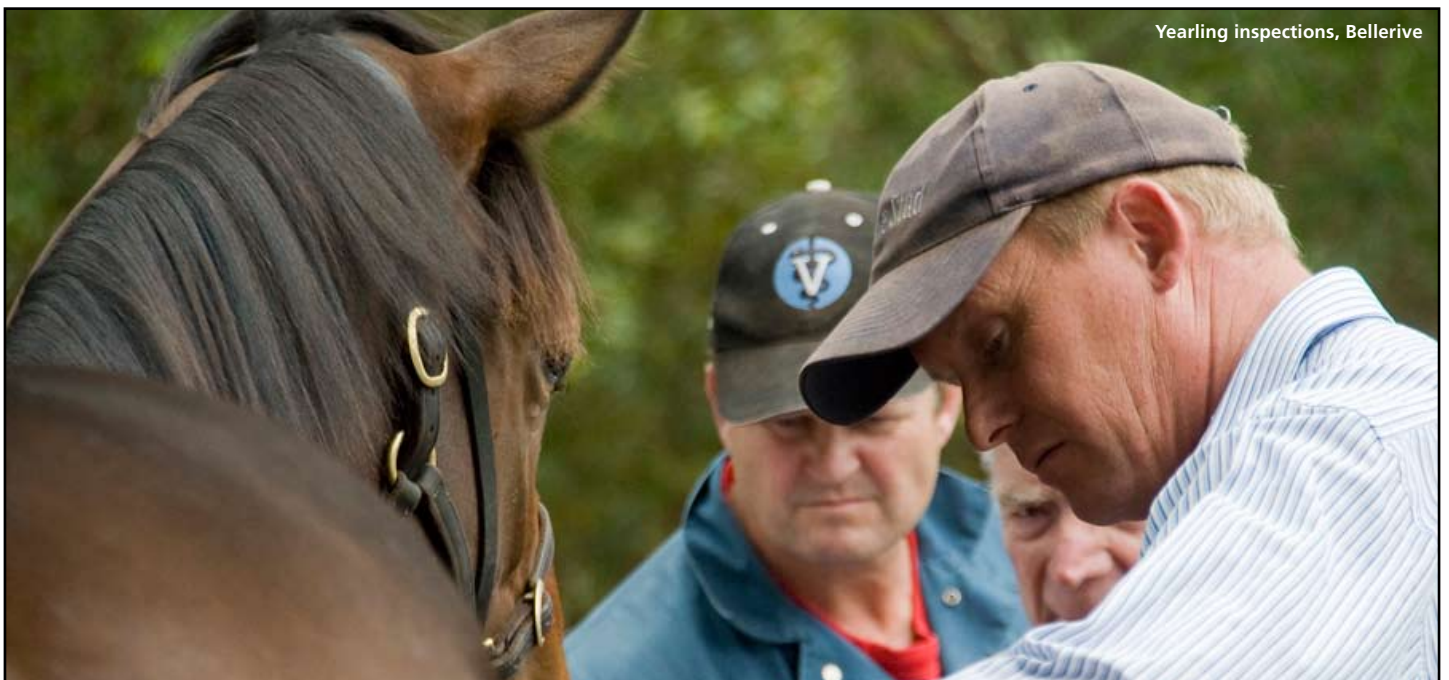
Yearling inspections, Bellerive

◆ CHARGE FORWARD ◆ DANZERO ◆ FLYING SPUR ◆ HUSSONET ◆ NOT A SINGLE DOUBT ◆ REDOUTE'S CHOICE ◆ SNITZEL ◆ STARCRAFT