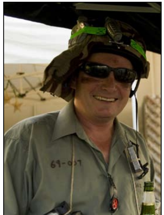
Wahroonga Barn team