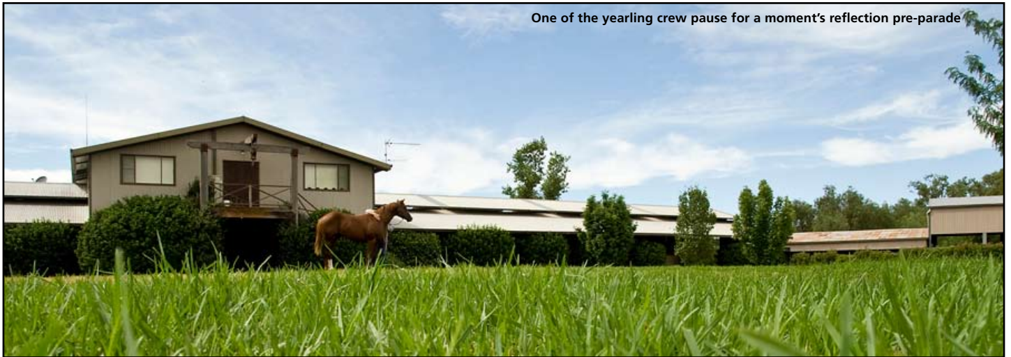
One of the yearling crew pause for a moment's reflection pre-parade