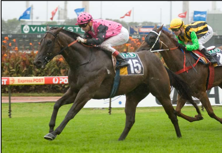
Griffon (Flying Spur)

Griffon backed this up with another win over 1100m (this time on a heavy Rosehill track) on 6 February.