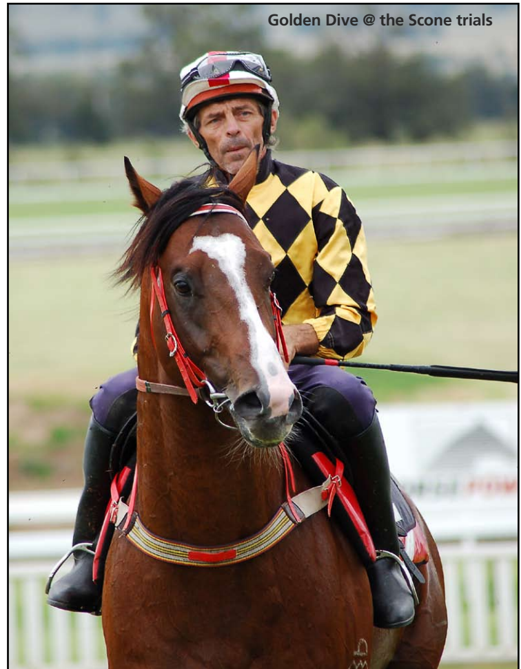
Golden Dive @ the Scone trials