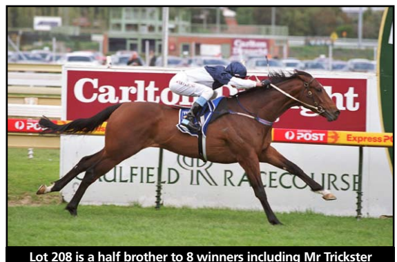
Lot 208 is a half brother to 8 winners including Mr Trickster

◆ CHARGE FORWARD ◆ DANZERO ◆ FLYING SPUR ◆ HUSSONET ◆ NOT A SINGLE DOUBT ◆ REDOUTE'S CHOICE ◆ SNITZEL ◆ STARCRAFT