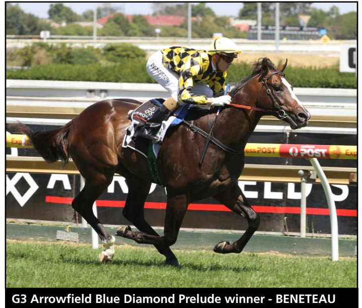
G3 Arrowfield Blue Diamond Prelude winner - BENETEAU