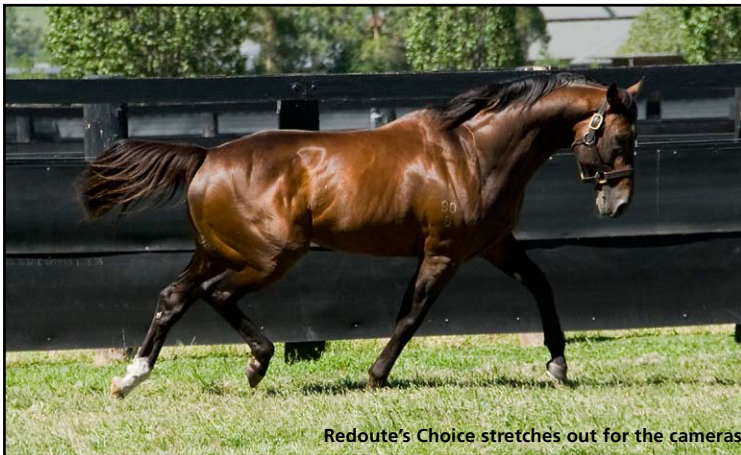
Redoute's Choice stretches out for the cameras