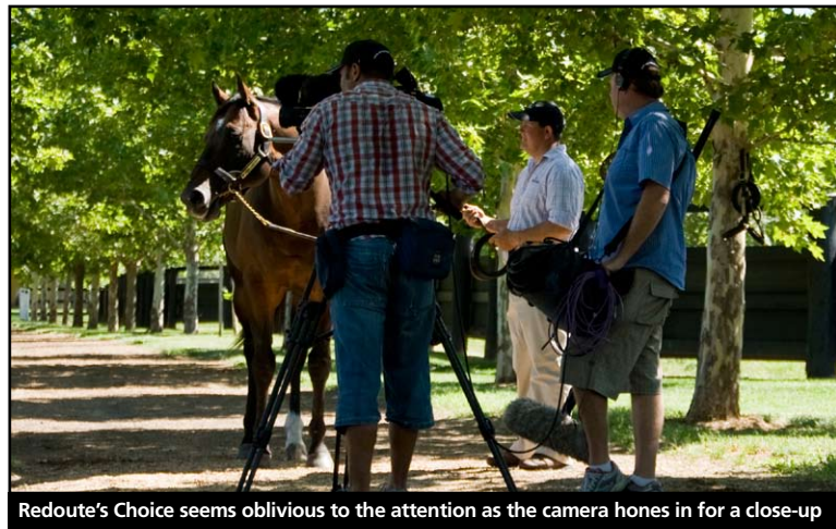
Redoute's Choice seems oblivious to the attention as the camera hones in for a close-up

We have seen the first feature and it was fabulous so can't wait to see the next 2! All three will also be streamed on the new Arrowfield website that will go live in the coming weeks.