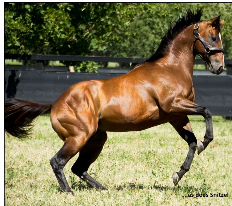
...as does Snitzel