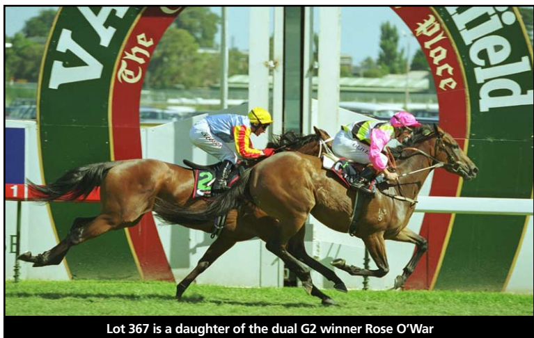
Lot 367 is a daughter of the dual G2 winner Rose O'War

• Lot 542 b/br.f Hussonet – Amourous (by Covetous) : half sister to the handy Macau galloper Elegance Classic out of a city winning half sister to the local stakes winner Love And Money and the stakes placed Secret Gift. Grandam is a daughter of the G3 mare Sovereign Chick, dam of the Listed winner The Cloisters – in turn dam of the stakes winner My Middy and grandam of the Listed winner Kiss Me Katy.