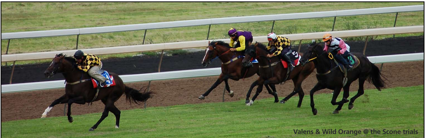
Valens & Wild Orange @ the Scone trials

◆ CHARGE FORWARD ◆ DANZERO ◆ FLYING SPUR ◆ HUSSONET ◆ NOT A SINGLE DOUBT ◆ REDOUTE'S CHOICE ◆ SNITZEL ◆ STARCRAFT