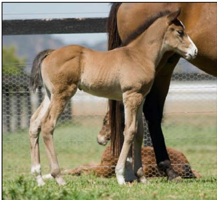
Bay colt by Charge Forward ex Barsha foaled 22 September (photo 1/10). This colt has the rather unique distinction of being inbred to Charge Forward's grand dam (Dream Appeal) 3 x 3