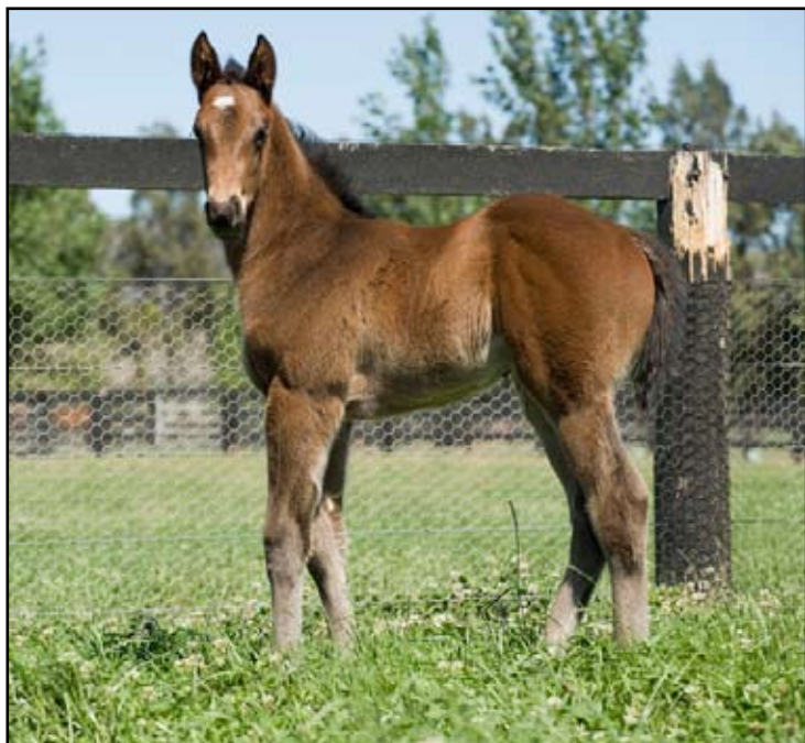
Br colt by Redoute's Choice ex Rockabubble foaled 7 September (photo 24/9). The second foal of the G1 winner ROCKABUBBLE .