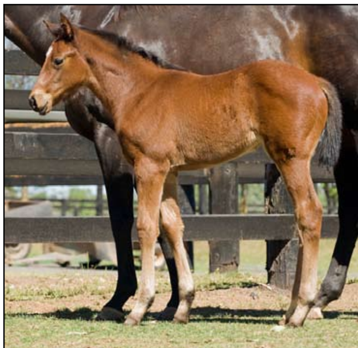
Bay filly by Danzero ex Burningwood foaled 24 August (photo 24/9). Burningwood is a half sister to ALLWOOD , IWOODIFICOULD and Jade-wood (dam of MARWOOD )