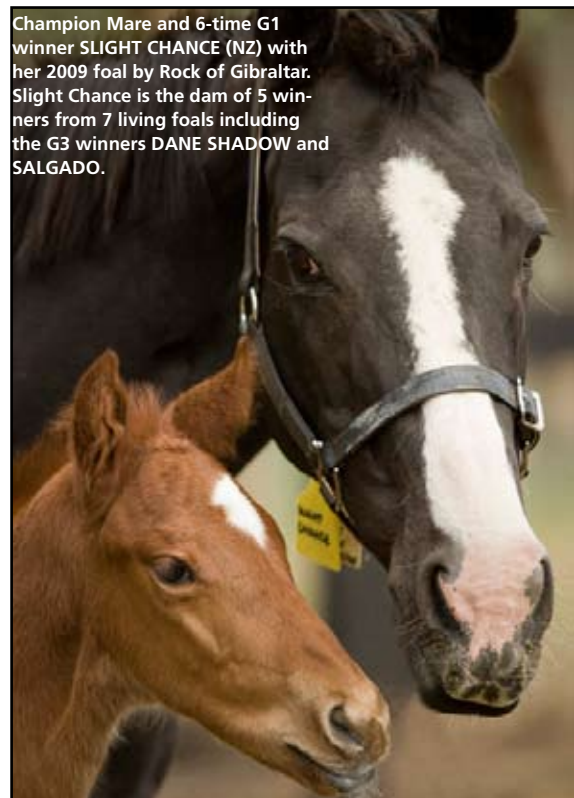
Champion Mare and 6-time G1 winner SLIGHT CHANCE (NZ) with her 2009 foal by Rock of Gibraltar. Slight Chance is the dam of 5 winners from 7 living foals including the G3 winners DANE SHADOW and SALGADO .

◆ CHARGE FORWARD ◆ DANZERO ◆ FLYING SPUR ◆ HUSSONET ◆ NOT A SINGLE DOUBT ◆ REDOUTE'S CHOICE ◆ SNITZEL ◆ STARCRAFT