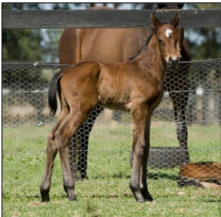
Bay colt by Not A Single Doubt ex Tennessee Sunrise foaled 29 September (photo 1/10). This colt hails from the famous TENNESSEE VAIN family