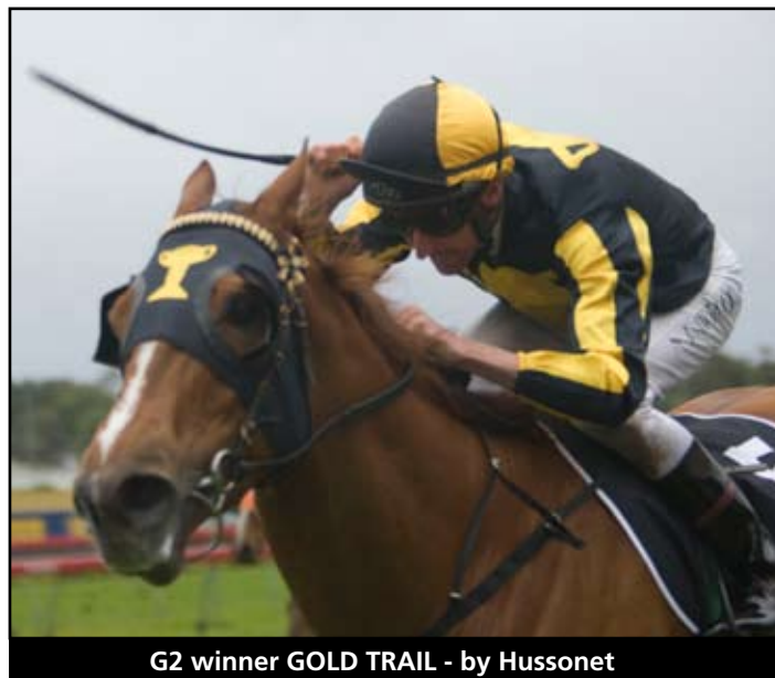
G2 winner GOLD TRAIL - by Hussonet