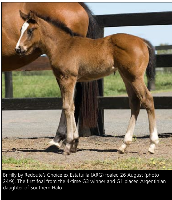
Br filly by Redoute's Choice ex Estatuilla (ARG) foaled 26 August (photo 24/9). The first foal from the 4-time G3 winner and G1 placed Argentinian daughter of Southern Halo.