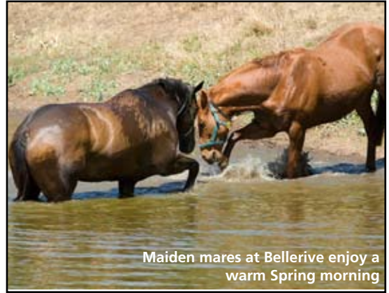
Maiden mares at Bellerive enjoy a warm Spring morning