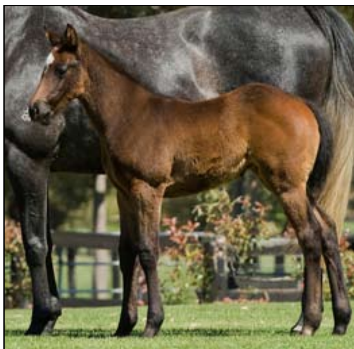
Br filly by Hussonet (USA) ex Zarakiysha (IRE) foaled 11 August (photo 25/9). The first foal from the half sister to Champion European filly and 5-time G1 winner ZARKAVA