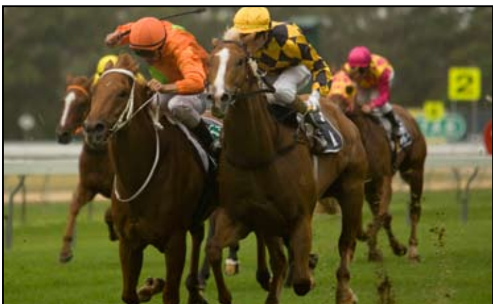
Hunter and North West Racing Association's Horse of the Year - BATTLEFIELD