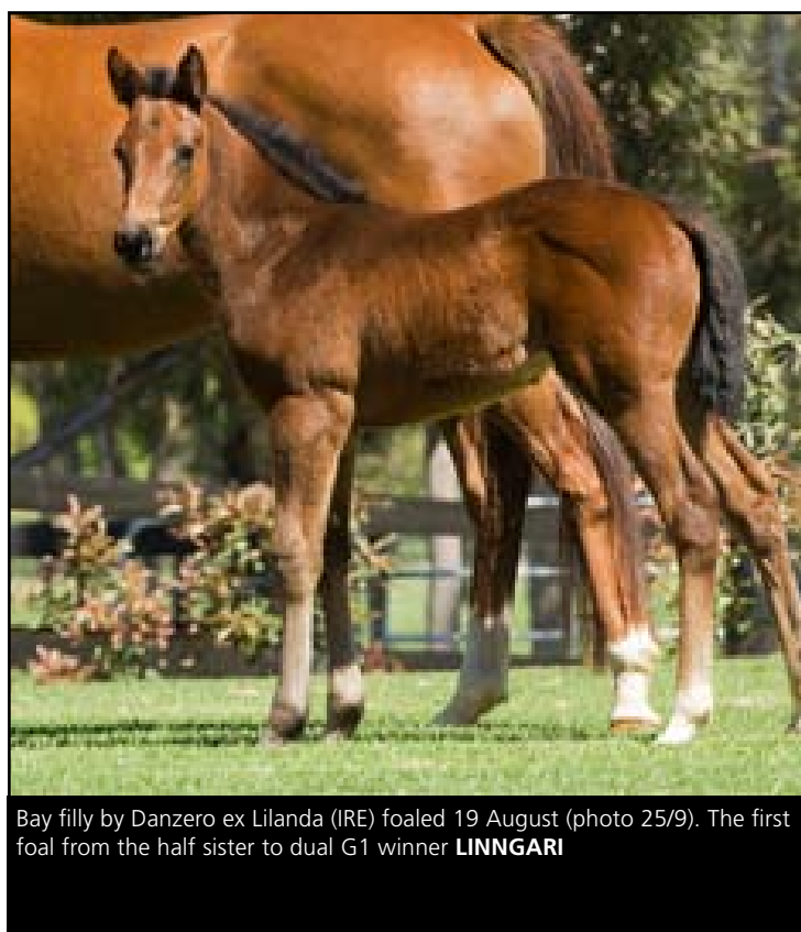
Bay filly by Danzero ex Lilanda (IRE) foaled 19 August (photo 25/9). The first foal from the half sister to dual G1 winner LINGARI