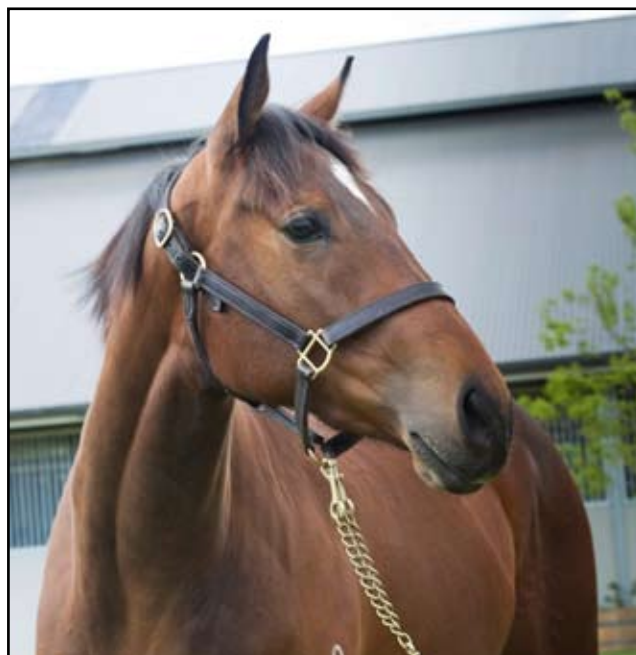
FLOWERCHILD (by Redoute's Choice)

Flowerchild has very reputable antecedents, being by the aforementioned champion sire out of the family of champion Northerly, their dams being half sisters. Bred on the same Danehill/Rory's Jester nick that has been an overwhelming success generally, and the identical Redoute's Choice variant that produced current hot young Arrowfield sire Not A Single Doubt, Flowerchild is, like her famous relative Northerly, a double RF ( Rasmussen Factor ), being inbred to two superior females through different individuals within five generations. Flaming Page in both cases and Natalma rather than Dinner Partner in Flowerchild's case.