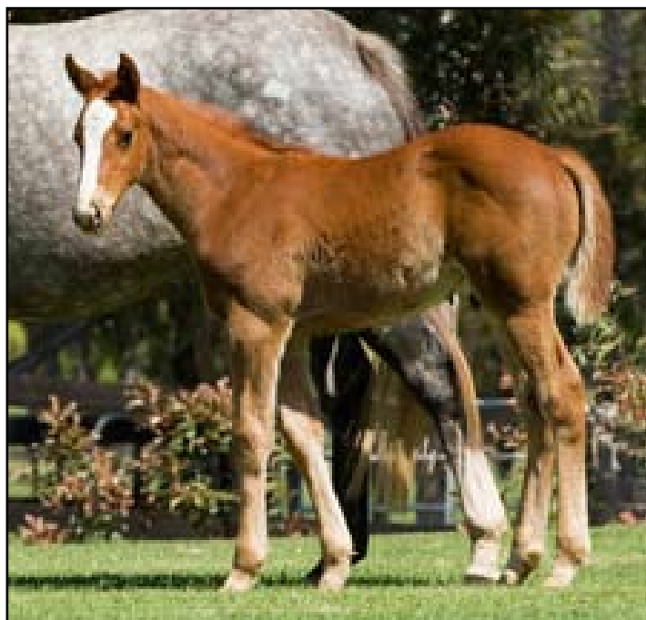
Ch colt by Flying Spur ex Tazkara (FR) foaled 19 August (photo 25/9). The first foal from the half sister to G3 winner TASHELKA and the stakeswinner and G1 placed TASHKANDI